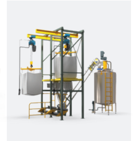
Reusable Bulk Bag Discharger