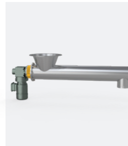
Dosing Screw Feeder