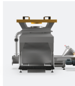
Bulk Bag Screw Feeder