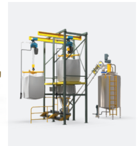
Reusable Bulk Bag Discharger