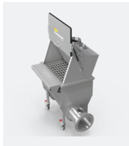
AMC Screw Feeder