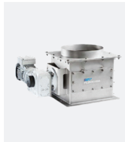
Rotary Lump Breaker