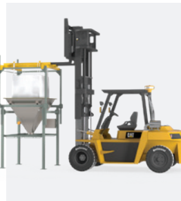
Disposable Bulk Bag Discharger